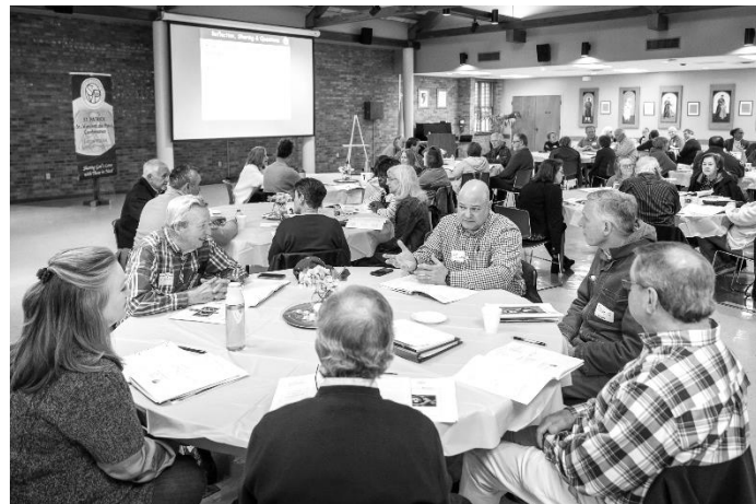
St. Vincent de Paul Conference Members from throughout the Diocese of Baton Rouge gathered on January 21, 2023 for an Ozanam Orientation. The orientation is named in honor of Frederic Ozanam, founder of the Society of St. Vincent de Paul.

Please consider making a gift for someone who is praying for a miracle. You can be the helping hand they need and the answer to their prayers.